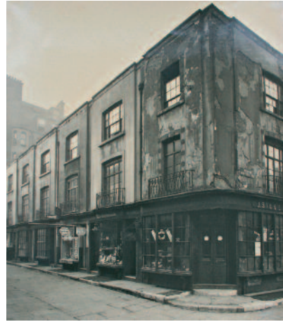
Fig. 6. The north terrace in 1922 showing extent of alteration of bay windows, loss of detail and general dilapidation. By kind permission of the Duke of Bedford and the Trustees of the Bedford Estates.

The Bedford Estate in Bloomsbury was never as fashionable as Cubitt's next major development of Belgravia, with its close proximity to the new Buckingham Palace. It soon became apparent that the original plan to provide a gated community of large