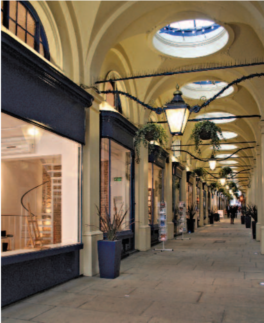
Fig. 12. Royal Arcade, Pall Mall. Author.