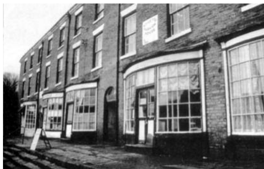
Fig. 9. 1-6 Market Place, Cheadle, Staffs. Shop doors in bow fronted windows. Alan Powers.

There is no firm evidence for the inspiration behind the design of the façades, but it is possible to examine the contemporary developments that might have influenced Cubitt. One obvious example of a