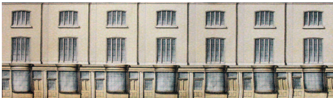
Fig. 7. Coloured alteration of the south terrace, 1821.

According to Hobhouse, at least three designs were separately proposed for Woburn Walk. The first, of a single storey with round-headed windows, was discarded as the plot had been incorrectly measured; the second (Fig. 7) was passed over for a slightly more intricately designed third elevation, as