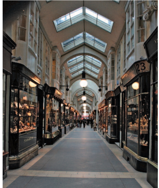
Fig. 13. Burlington Arcade, Piccadilly. Author.

It was not just the architectural styling of the arcade, but also the stringent controls the proprietor upheld over traders in order to maintain respectability that was likely to inspire Cubitt when he conceived Woburn Walk. The Burlington Arcade has been patrolled by beadles (security guards) in top hats and tails since its opening, providing a sense of control which one can imagine would have impressed Cubitt, with his strong desire for securing respectability.