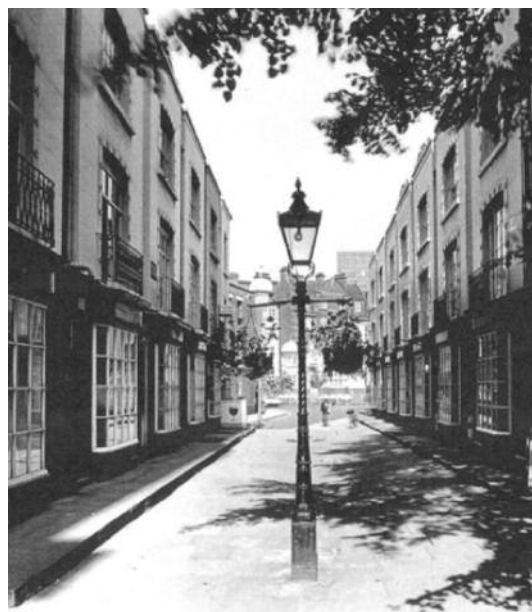
Fig. 1. A very attractive view of Woburn Walk taken in the late-1980s after the last major works. The extent of piecemeal alteration to the elevations and the streetscape since then has had a significant impact.

The advent of fashionable retailing brought about impressive commercial exchanges, the first of which was Royal Exchange on Cornhill (1566–8), and other purpose-built shopping venues including bazaars and arcades for the wealthy to browse under the cover of a roof, such as Exeter Exchange (1708, previously housed within Exeter House on the same spot on the Strand) and the Soho Bazaar