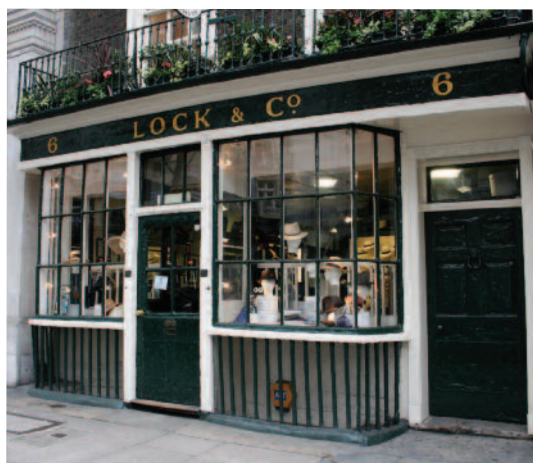
Fig. 4. A shop converted entirely at ground floor, St James Street.

Cubitt promoted and encouraged the same approach when he started developing the northern part of the Bedford Estate in 1821. 5 He was committed to developing the site over a period of years, and the rate at which he would be able to lease his new buildings would be governed by their desirability. Despite the general attitude towards commercial activity within the Estate, he was sufficiently astute to realise that the area required even the most modest provision of shops. Although it was designed to be quiet and residential, having no local facilities would be inconvenient and unpopular with residents. Like the houses they were built to serve, in Tavistock Square and the streets around it, the shops at Woburn Walk were an early development in speculative building. This meant the Estate could control who would take them and begin trading in the area. Even where shops were to be permitted, extensive lists of ‘offensive trades’ were prohibited by covenant in every building and repairing lease. 6 This early form of town planning not only established the separation of residents from potentially hazardous trades, but also contributed to