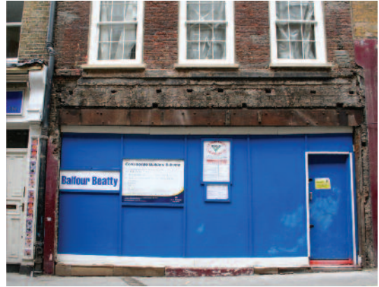
Fig. 3. Original timber bressummer with steel support uncovered during works to a shop in New Street, Covent Garden.

floors to be reached by a separate door. (Fig. 4) Intricate classical details were introduced to break up what was otherwise a large plain opening where a bressummer was inserted to hold up the front façade above ground floor, allowing a shop front to be built underneath. (Fig. 3) Classical columns, pediments and scrolled corbel brackets were standard features of architectural detail design books such as W. & J. Pain's Decorative Details . 2 (Fig. 5) Surviving examples are of great interest to conservationists, since there are few remaining in anything like their original condition.