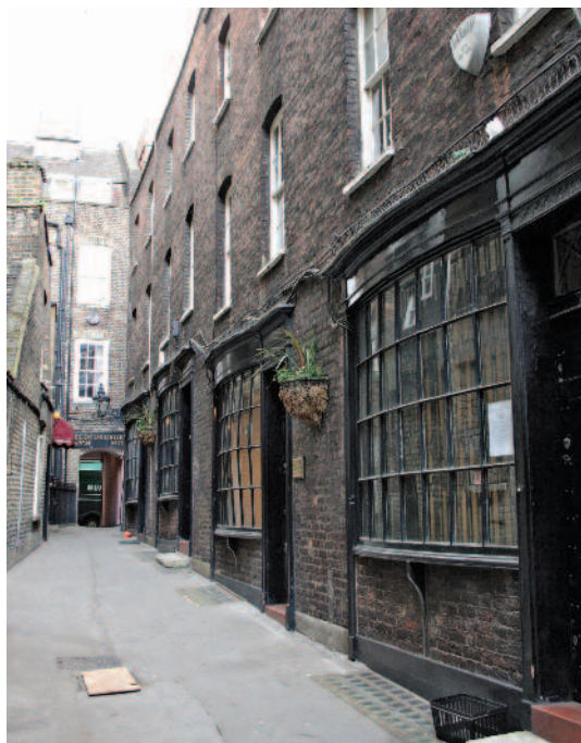
Fig. 10. Nos. 1 to 8 Goodwin's Court, Covent Garden. Author.

their time, or that ties them to the shop front design with any architectural design or detail.