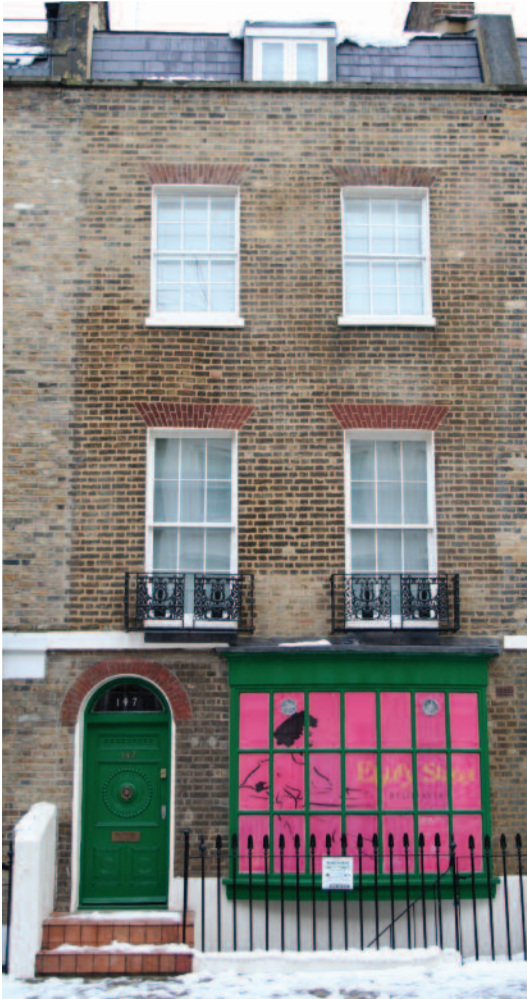
Fig. 2. House with minimal conversion for shop use. Ebury Street, Belgravia. Author.

A general typology of shops converted from houses and the less common type (those set out to incorporate shops) can be described as follows: