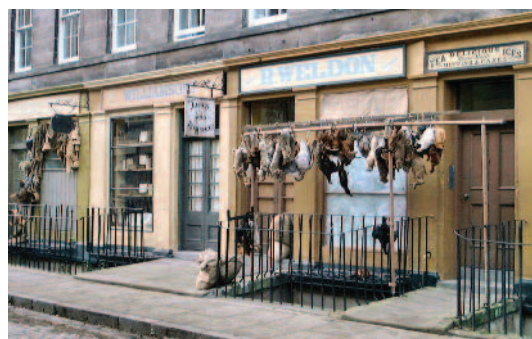
Fig. 11. William Street, Edinburgh.

The design of Woburn Walk can probably be traced to the birth of the shopping arcade in London.